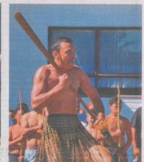
CHALLENGING MOMENTS: The haka party included students from Whakatane High School, Trident High School, Te Wharekura o Ruatoki, Tawera Primary School, Waimana School and Taneatua School. D2862-25