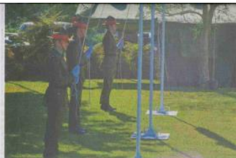
FLAGGING IT: New Zealand soldiers lower the New Zealand, French and Belgium flags during the ceremony at Te Rewarewa Marae to mark Armistice Day. D2862-38