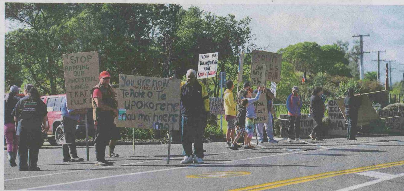
PROTEST: Members of Te Upokorehe protest the Te Urewera-Tuhoe Bill in Ohope in May.

Mr Finlayson has reacted by saying while he agreed with the court's jurisdictional error finding, the Waitangi Tribunal was correct when it found no