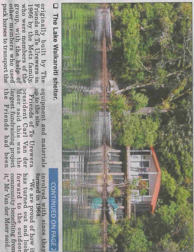
□ The Lake Waikareiti shelter.

The Friends of Te Urewera donated $46,000 to the upgrade of the day shelter with the total project cost in excess of $200,000.